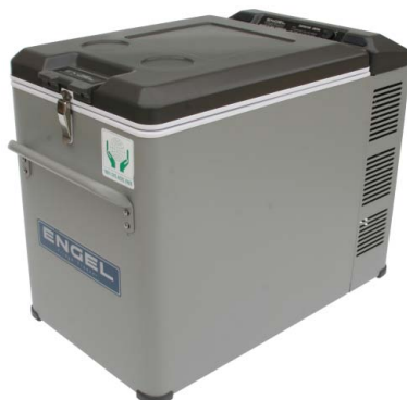
ENGEL MT45F-U1 AC/DC FRIDGE FREEZER 12V/24V DC/110V AC unit Inside: 15.4 x 10.8 x 16.4 Outside: 25.5 x 14.3 x 20 Weight: 52.9 lbs. 43 US Qt. Power: Variable 0.7-2.5 amps.