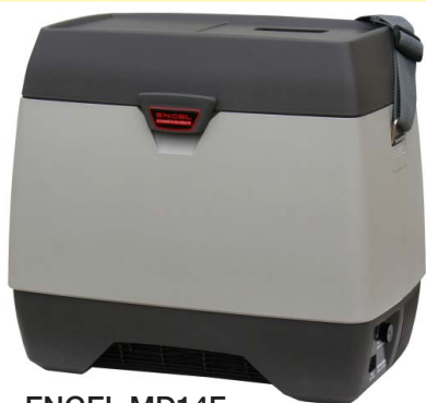
ENGEL MD14F DC FRIDGE FREEZER 12V/24V DC unit Inside: 13.75 x 7.5 x 8.2 Outside: 17.5 x 11.3 x 15.8 Weight: 26 lbs. 15 US Qt. Power: Variable 0.9-2.8 amps.