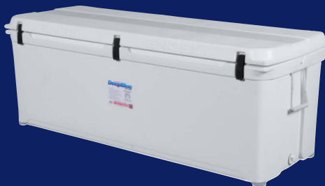
ENG 320 White

* Better Latches, do not stick out * Smooth clean cut, awesome design, no ugly chunks of plastic sticking out