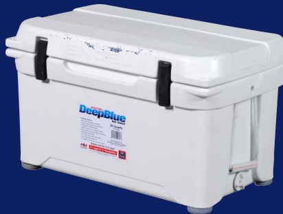
ENG35 White or Tan