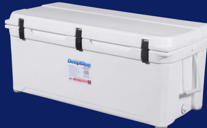
ENG123 White or Tan