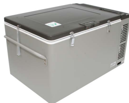
ENGEL MT60F-U1 DC FRIDGE FREEZER 12V/24V DC/110V AC unit Inside: 20.1 x 14.9 x 12.4 Outside: 31.1 x 19.3 x 17.4 Weight: 68.3 lbs. 64 US Qt. Power: Variable 0.7-3.6 amps.