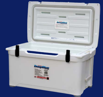
ENG65 White or Tan

* 2 inches of insulation, top, bottom and sides * Silicone lid seal, some companies still use rubber or none at all