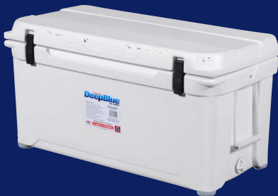
ENG80 White or Tan

* 2 inches of insulation, top, bottom and sides * Silicone lid seal, some companies still use rubber or none at all