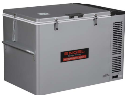
ENGEL MT80F-U1 DC FRIDGE FREEZER 12V/24V DC/110V AC unit Inside: 20.1 x 14.9 x 16.7 Outside: 31.1 x 19.3 x 21.7 Weight: 86 lbs. 84 US Qt. Power: Variable 0.7-3.6 amps.