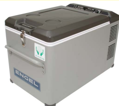
ENGEL MT35F-U1 AC/DC FRIDGE FREEZER 12V/24V DC/110V AC unit Inside: 15.4 x 10.8 x 12.4 Outside: 25.5 x 14.3 x 16 Weight: 46.3 lbs. 34 US Qt. Power: Variable 0.7-2.5 amps.