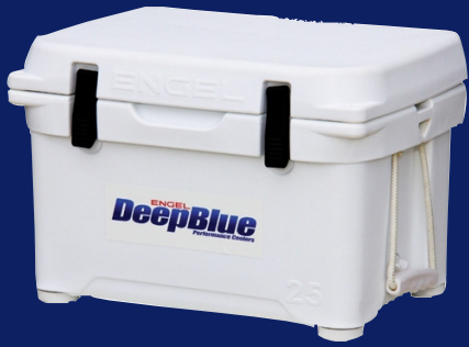
ENG25 White or Tan