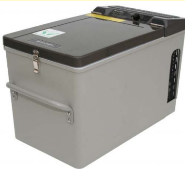
ENGEL MT17-U1 AC/DC FRIDGE FREEZER 12V/24V DC/110V AC unit Inside: 11.5 x 8 x 10 Outside: 21.2 x 12 x 14.2 Weight: 37 lbs. 16 US Qt. Power: Variable 0.6-2.3 amps.