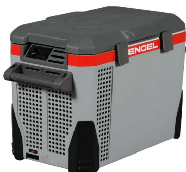
ENGEL MRO40F-U1 AC/DC FRIDGE FREEZER 12V/24V DC/110V AC unit Inside: 14.5 x 10.5 x 14.4 Outside: 25 x 15.5 x 18.5 Weight: 48 lbs. 40 US Qt. Power: Variable 0.7-2.5 amps.